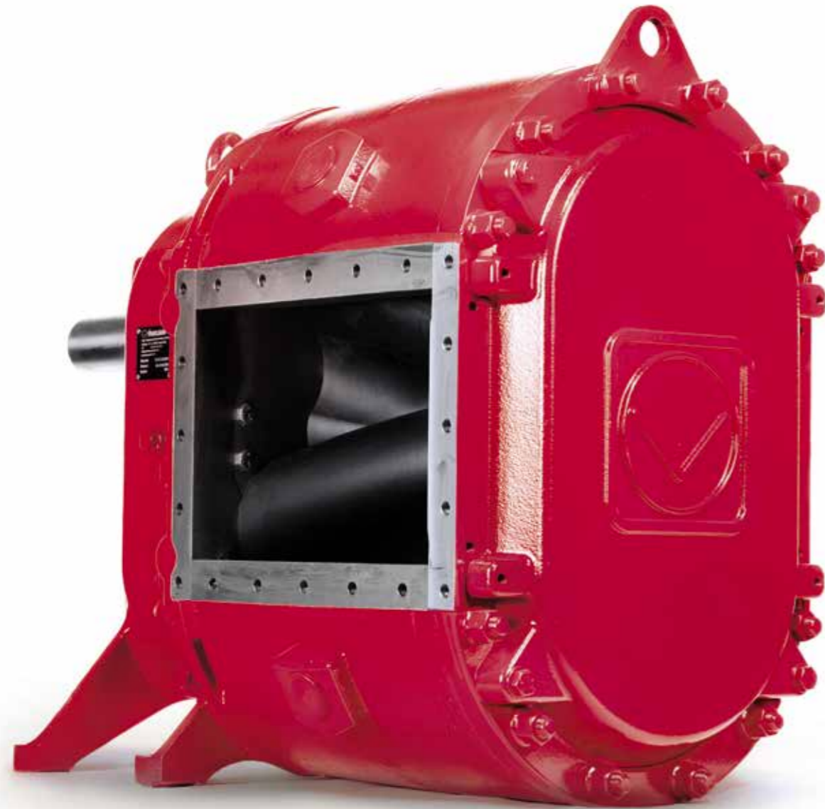
Service- and maintenance-friendly: the VX-series rotary lobe pumps

Vogelsang rotary lobe pumps: The efficient choice for a wide variety of conveying tasks